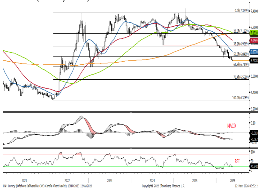
USDCNH (Weekly chart)

sentiment and some positioning ahead of high-level US-China engagement. Senior US and Chinese officials are scheduled to meet in Seoul on Wed ahead of Trump- Xi meeting in Beijing later this week, keeping markets alert to any signs of tariff restraint, purchase commitments or a clearer negotiating path. On the charts, the break below 6.80 is also notable as there appears to be limited support between current levels and around 6.72, though the PBoC's measured fixing pace suggests policymakers may still lean against any overly rapid appreciation. Bias remains mildly lower for USDCNH, but headline risk around the US-China meetings remains the key swing factor. Resistance at 6.8060, 6.8220 (21 DMA).